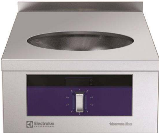
589035 (MCIHABEOAO) Induction Wok, 1 zone, one-side operated with backsplash